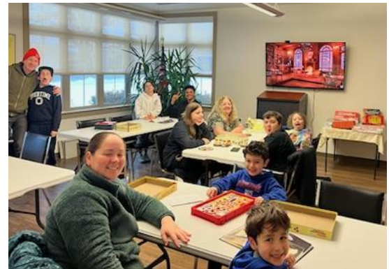
Family Game Night