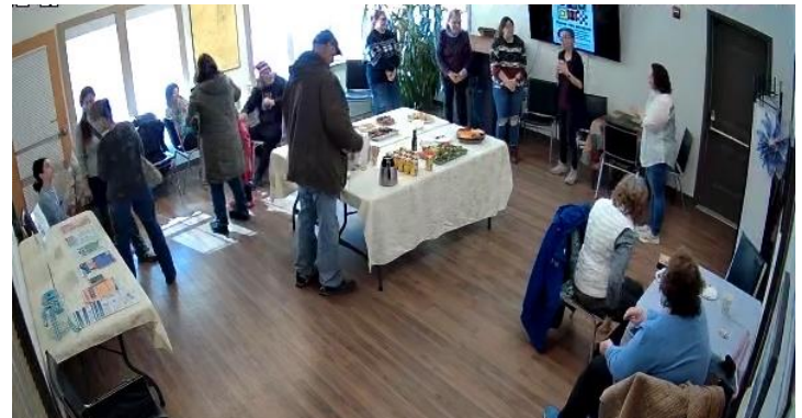
Tiny Art Show Reception