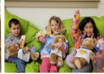
A grant received through First Book & Build-a-Bear gives 50 books & bears to local children.