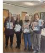
Friends of the Library begin the Book Fairies Program