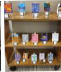
2nd Annual Tiny Art exhibit showcases over 45 local artists