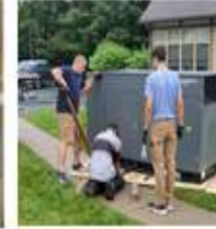
Our New Generator is installed