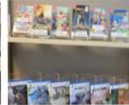
A new video game collection is available to the community