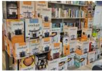
Partnership w/ the Food Pantry gives over 75 crock pots to local families