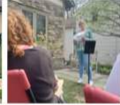
Catskilled: Poetry for Healing Plaque installed